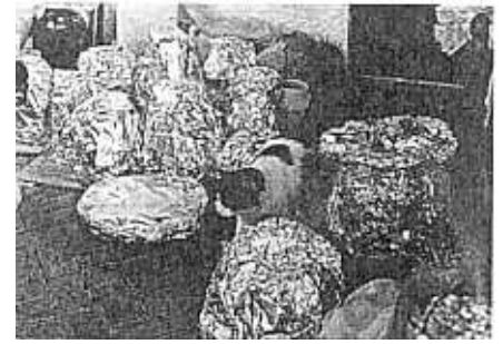
Figure 1. Merom wraps her pieces in aluminum foil to hold organic materials against the pot's surface during firing.

I wash the work with running water and scrub it well to reveal the beautiful colors. I then dip it into a solution of household wax (Johnson's), which I dilute 10:1 with water.